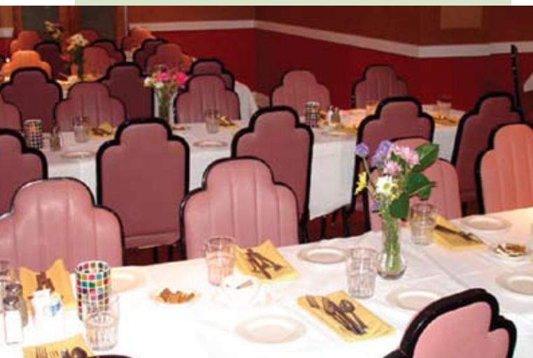
The Kitchen Bar offers you a traditional banquet room, or its newly renovated enclosed heated patio, available all year around.

We look forward to bringing together all of our professional staff to make your event a memorable one.